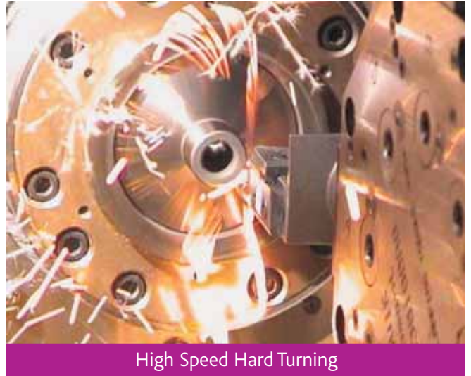
High Speed Hard Turning